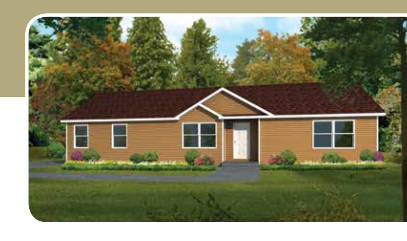
1st Floor = 1,644 Total = 1,644 S.F.