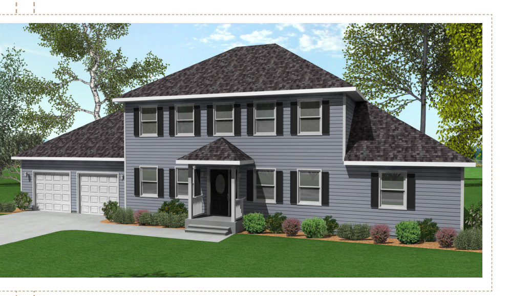
Renderings depict optional features.