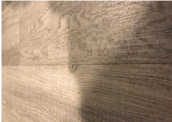
✓ Luxury Vinyl Planking

Laminate Planking: The inner layer is composed ✗ of fiber board materials and may scratch over time in high-traffic areas. Laminate planking is not waterproof and susceptible to swelling, bending, and damage if exposed to water in kitchen, bath, dining or laundry rooms. The top layer is thin and if scratched cannot be repaired and must be replaced. Laminate planks may also chip at the corners with extensive wear.