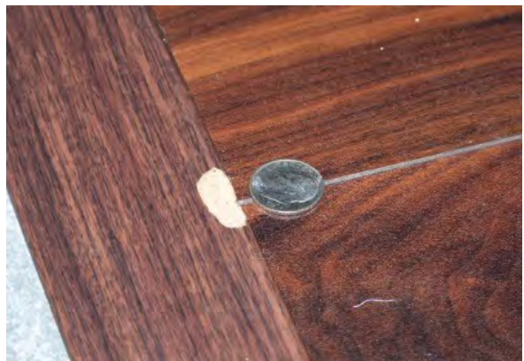
✗ Laminate Planking