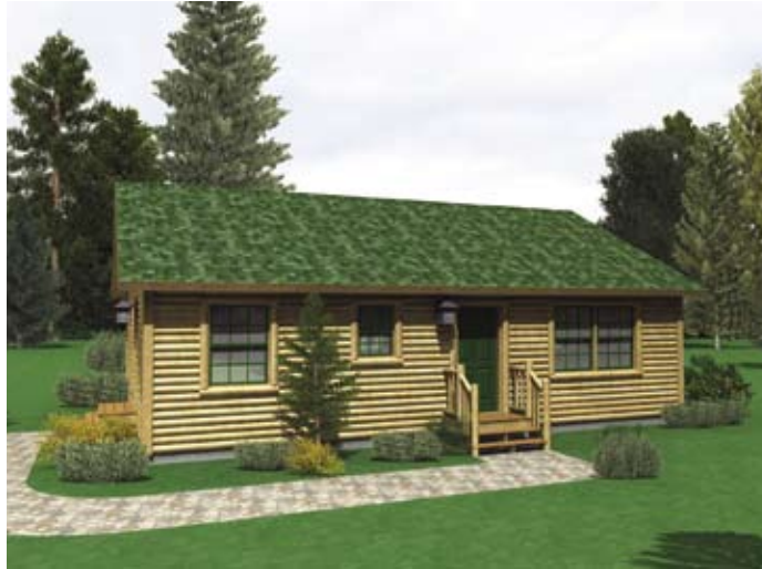
Standard elevation with optional coach lamps, window grids, steps, and railing