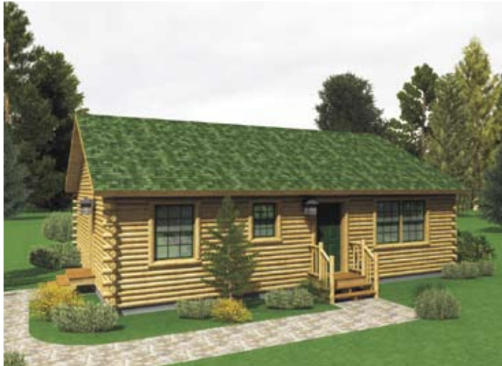
Plan shown with optional butt and pass corners, window grids, coach lamps, steps, and railing