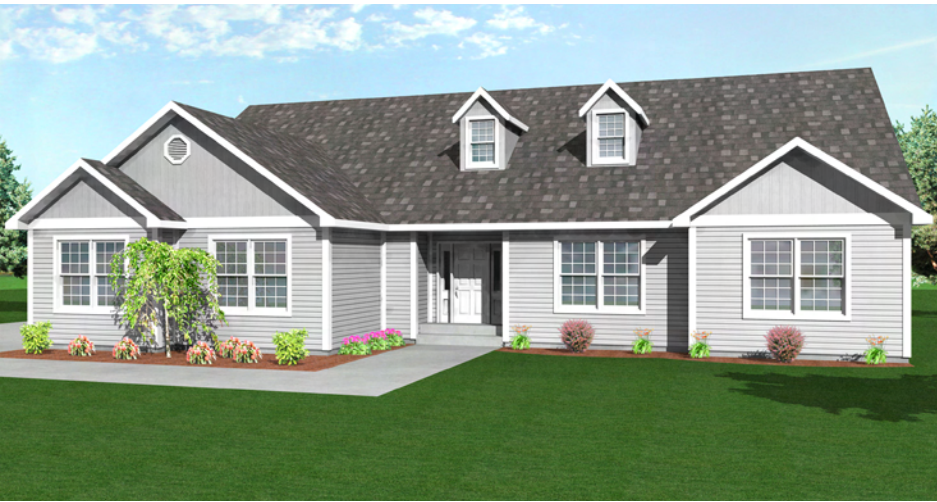
Renderings depict optional features.