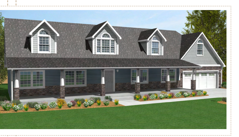
Renderings depict optional features.