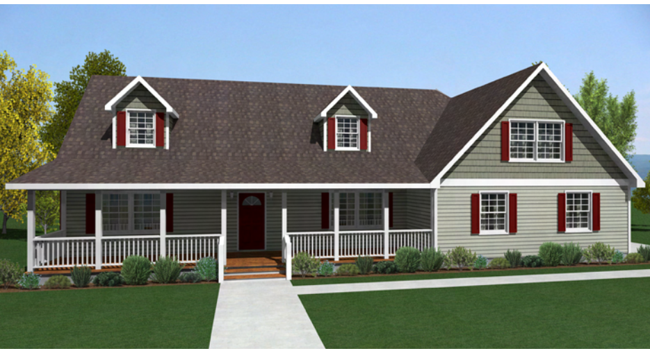
Renderings depict optional features.